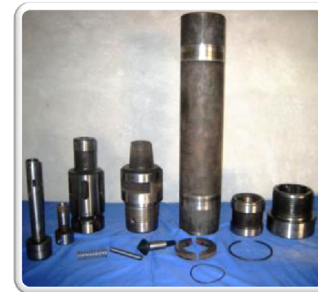
PARTS OF KGR DTH HAMMER

Equivalent Shank Type: SD-4, QL-40, DHD-340, COP 42.